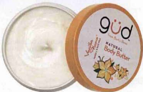
GüD Natural Body Butter in Vanilla Flame, $12, drugstores

• Foundation shades should have golden tones and no SPF (which can sometimes look gray against skin).