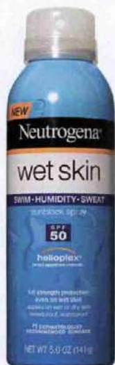
Neutrogena Wet Skin Sunblock Spray SPF50, $11, drugstores

• Apply and reapply at least SPF30 every two hours and after swimming. Staying in the shade is ideal.